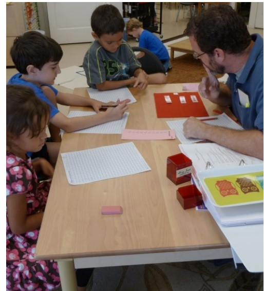
Elementary Math Lesson