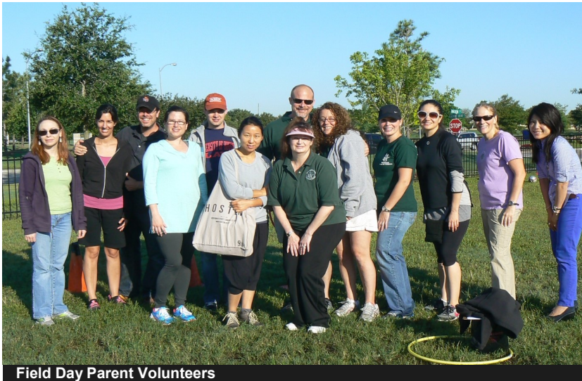
Field Day Parent Volunteers