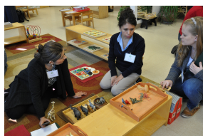
MONTESSORI JOURNEY IN REVIEW