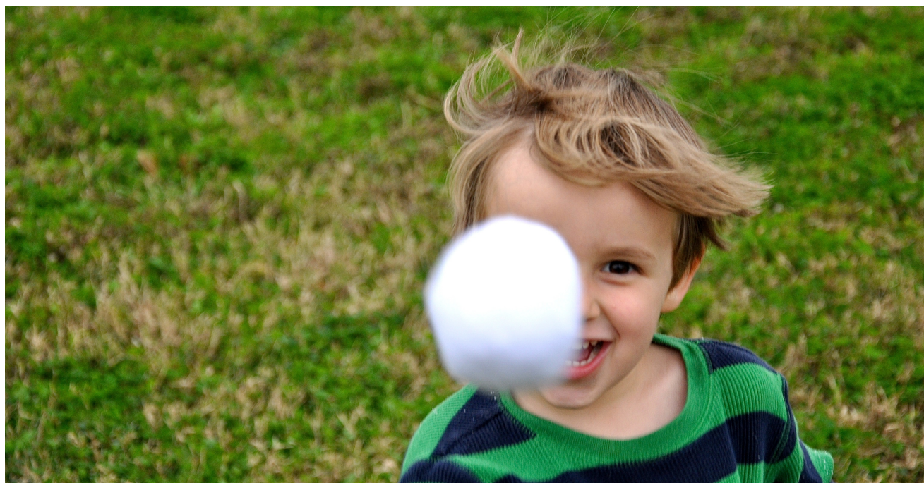
Throwing “snow balls”- after a science class