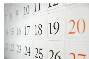
COMING UP IN