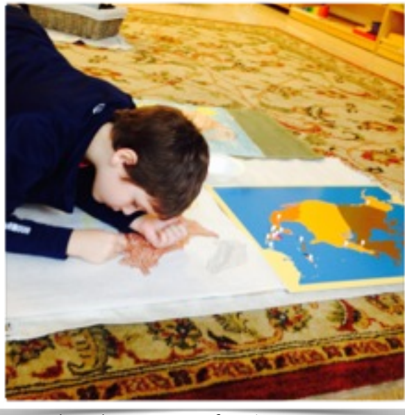
Recording the countries of N.America....