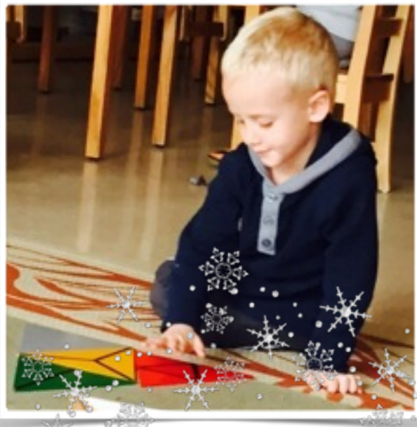
Studying Equilateral triangles.....