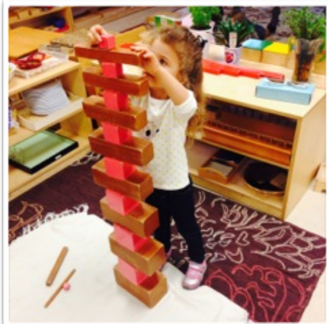
Does that look like a Tall Tree??.....