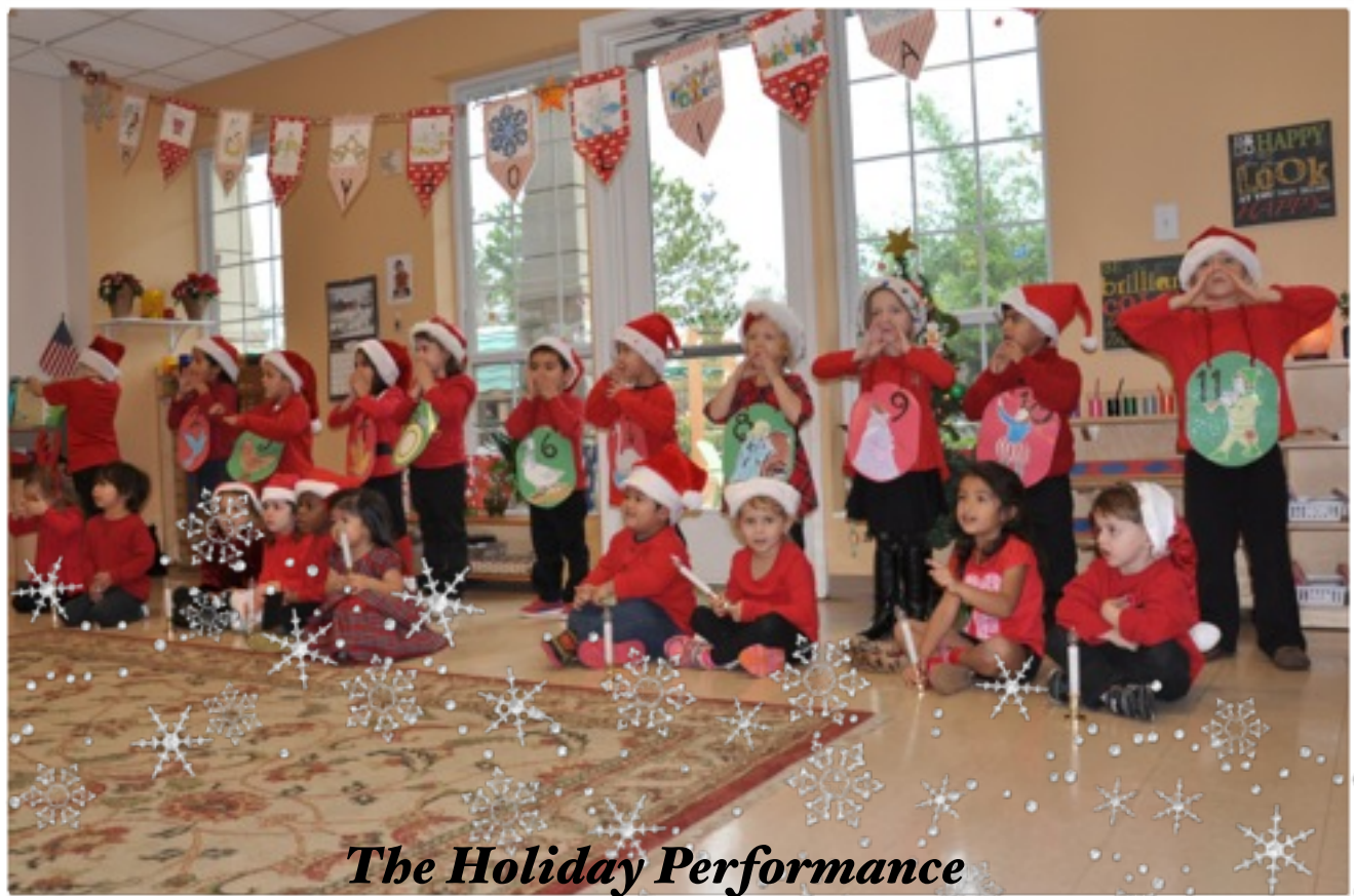
The Holiday Performance

Hope everyone enjoyed the holiday season and spent time with family and friends. Sincerely wish that 2015 brings you love, peace, good health and prosperity all year round.