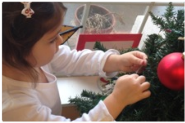
Decorating the Tree.....