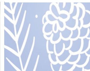
WINTER PARENT COFFEE